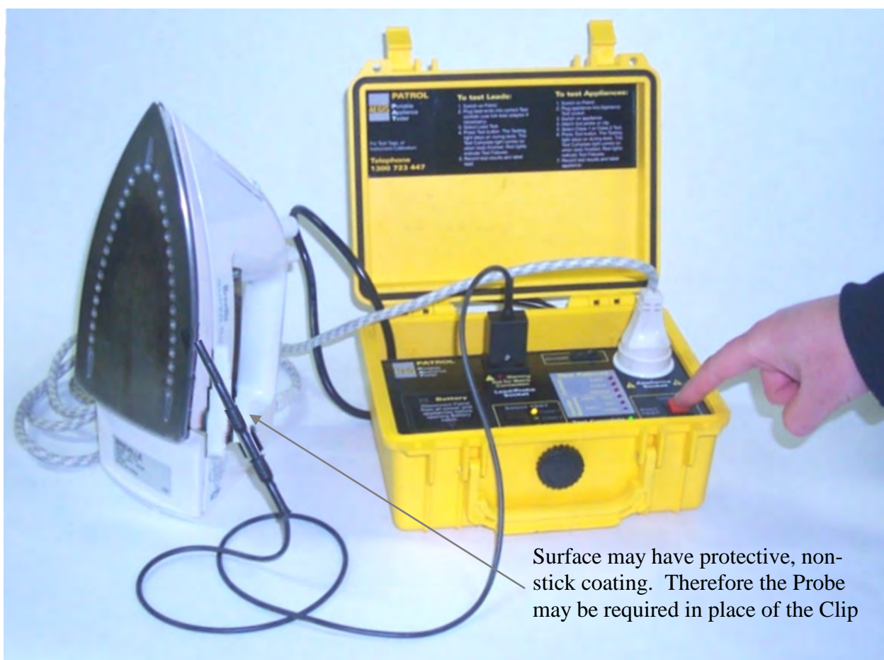
Figure 4.2.1-1 Class 1 Appliance Test connections.