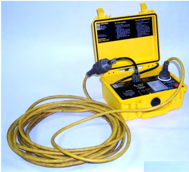
Figure 4.3-1 Extension Lead Test Connections