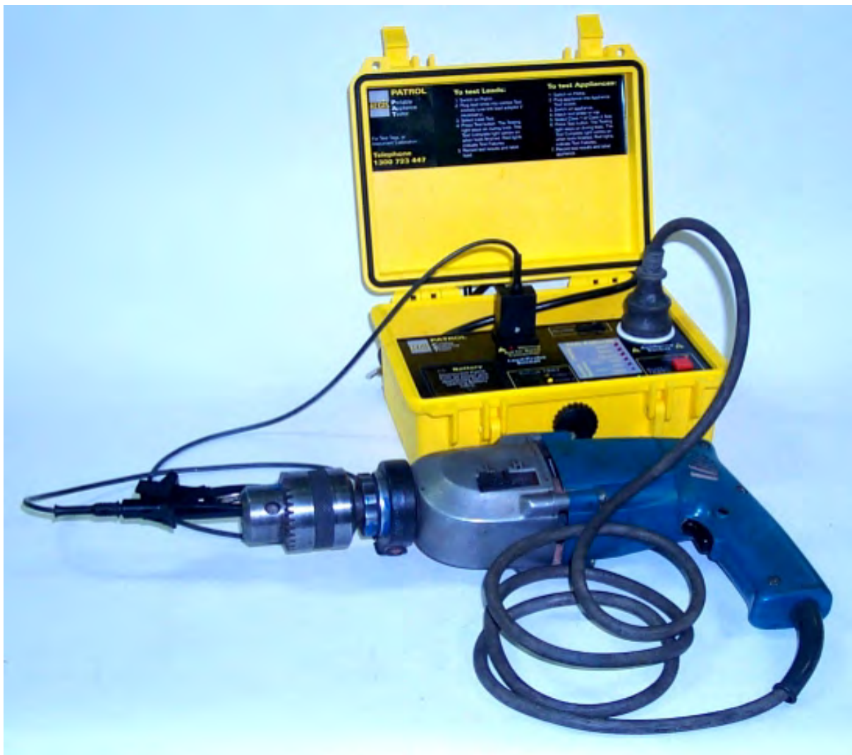
Figure 4.2.2-1 Class 2 Appliance Test connections, using the Clip