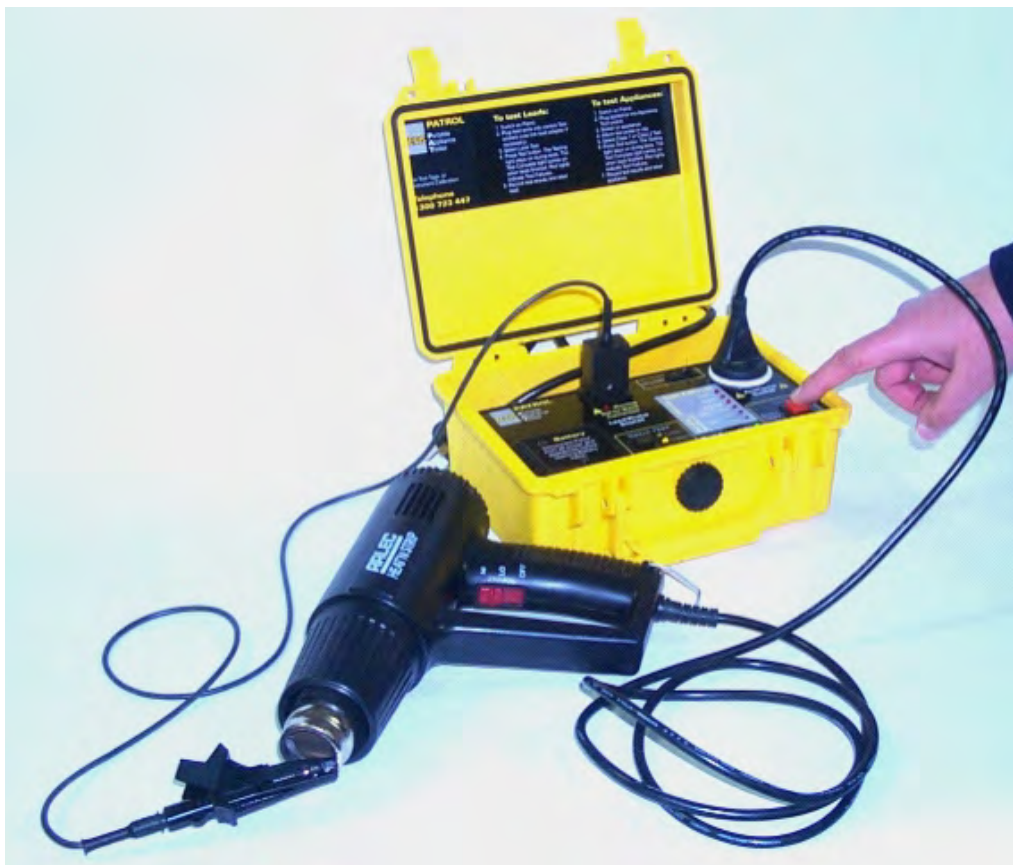
Figure 4.2.2-3 Class 2 Appliance Test Connection using the Clip