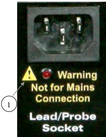
Figure 1.1-1 Warning notice on Lead/Probe Socket