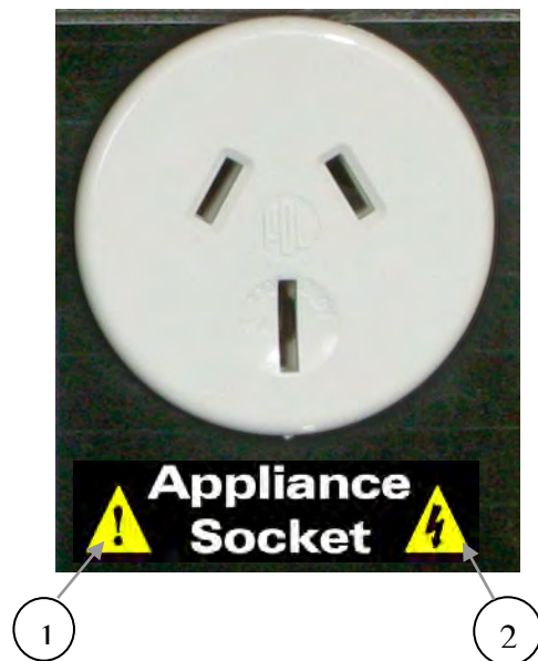
Figure 1.2-1 High Test Voltage at Appliance Socket