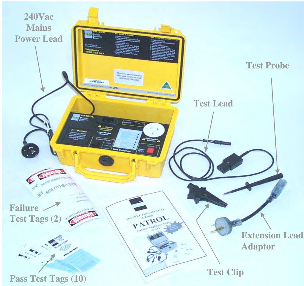
Figure 4.1-1 Components and Accessories supplied with the PATROL

This section offers the step-by-step instructions on how to set up and use the PATROL, to perform Portable Appliance and Extension Lead tests.