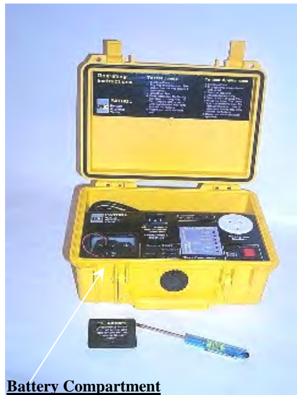
Figure 6.7-1 PATROL Battery Replacement

Note carefully the direction of the batteries when placing them into the battery holder. Use only:- AA Alkaline Type IEC-LR6 or equivalent batteries