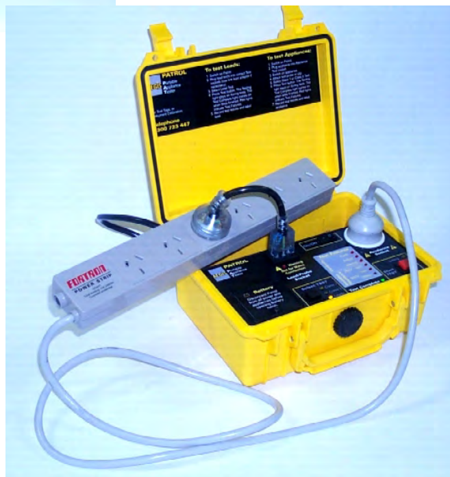
Figure 4.3-2 Multi-way Power Board Test Connections