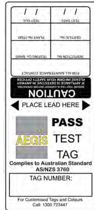
Figure 8.1-1 PASS Test Tag, Part No CZ5072 (100 tags)

Additional or replacement “PASS” Tags can be purchased from Aegis Pty Ltd by phoning 1300 723447