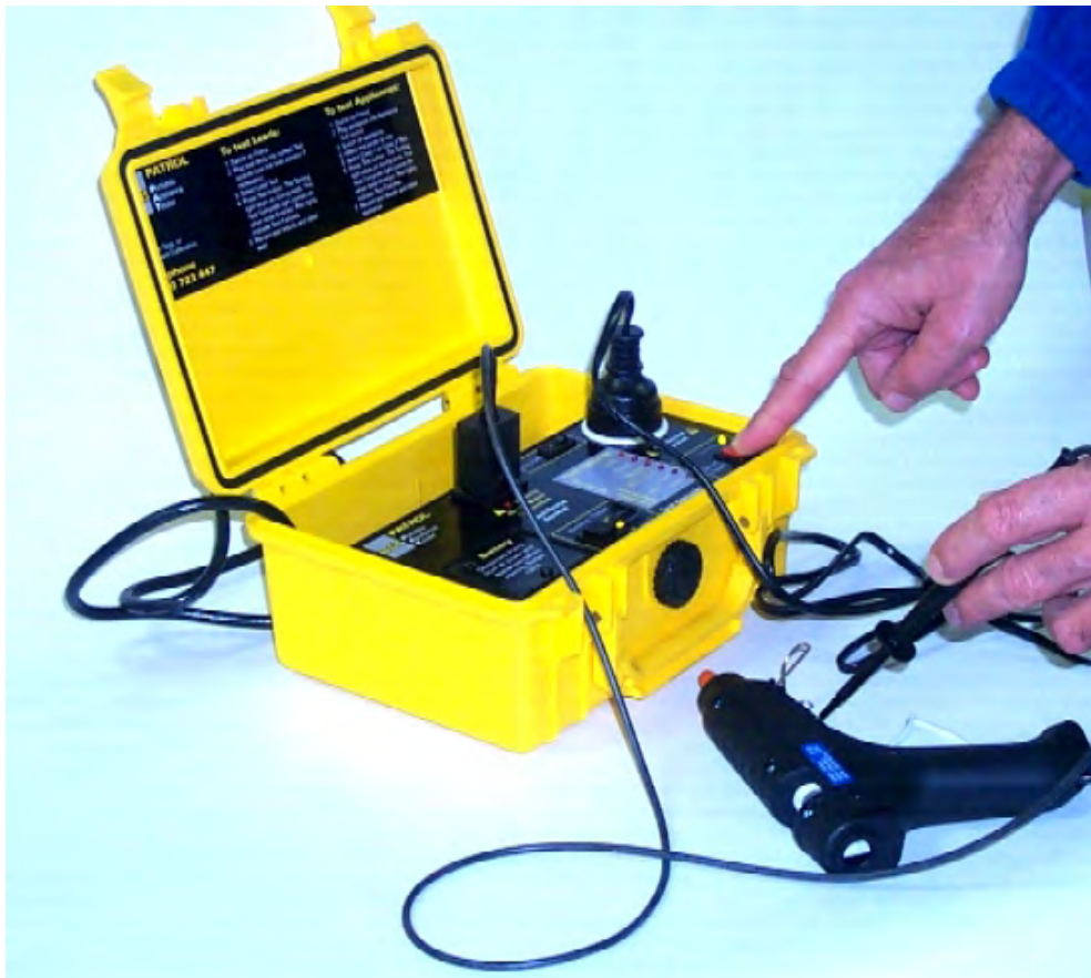
Figure 4.2.2-2 Class 2 Appliance Test Connection using the Probe